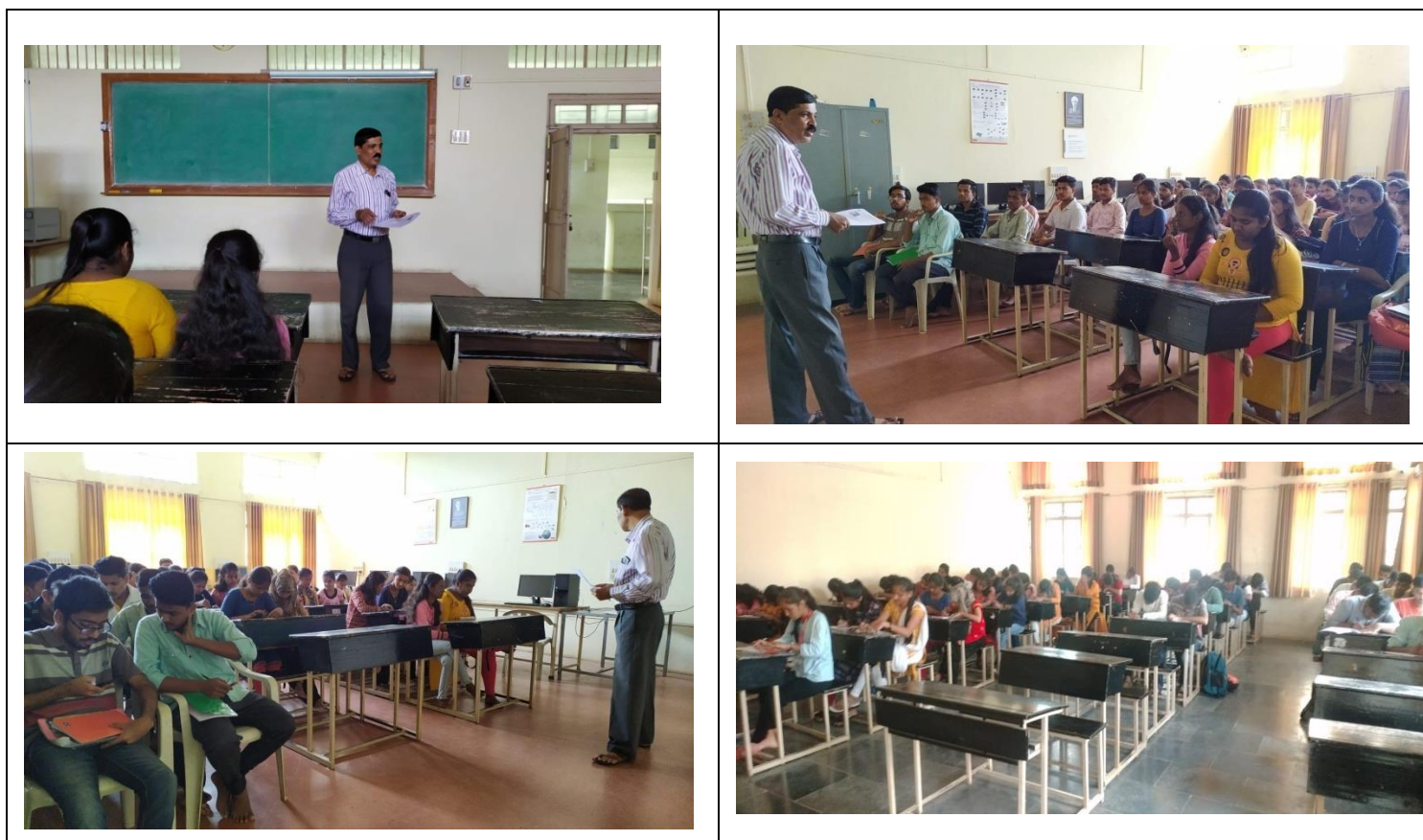
Rules & Regulations, Evaluation Method, writing skills etc explained to students.

Description of Activity: As Three weeks of Intra Institutional Internship Program scheduled for 2 nd Sem ECE Students from 11 th -30 th October, Essay Competition was conducted on 20th October-2022. The session was arranged by ECE Department. On this session simple tricks of how to write Essay, Rules & Regulations, Evaluation Method, writing skills etc explained to students.